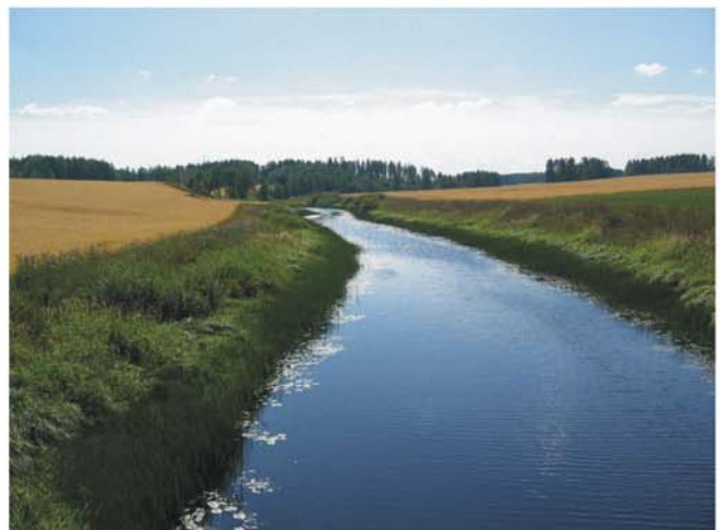
Figure 2. Buffer zones in the mid-reaches of the Yläneenjoki main channel.